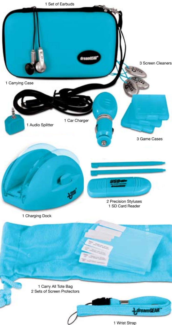
1 Set of Earbuds

dreamGEAR and the dreamGEAR logo are registered trademarks. Nintendo and DS are either registered trademarks or trademarks of Nintendo of America. This product is not designed, manufactured, licensed, endorsed or distributed by Nintendo of America.