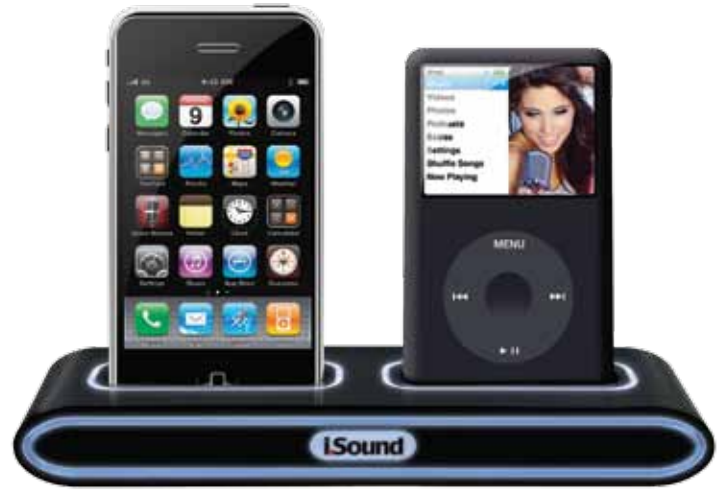
Custom LED Illumination