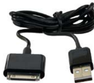
1 Charge/Sync Cable