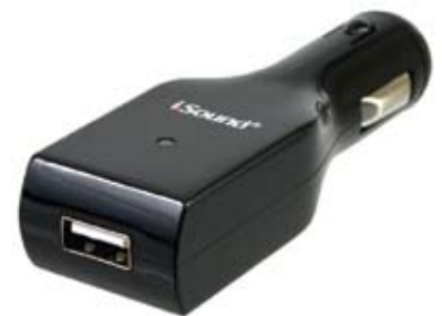
1 USB Car Charger