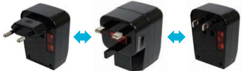
1 Universal USB AC Adapter

The included Charge/Sync Cable is compatible with most 30 pin iPhone and iPod models and can be used in conjunction with the included USB AC adapter or USB Car Charger. The Charge/Sync Cable can also be used to charge and sync data from any computer or powered USB device.