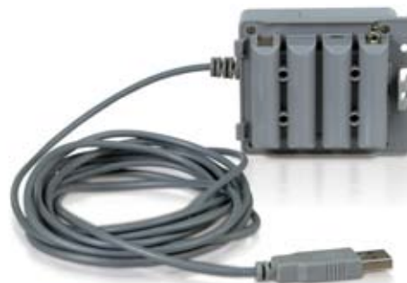
1 Power Fit